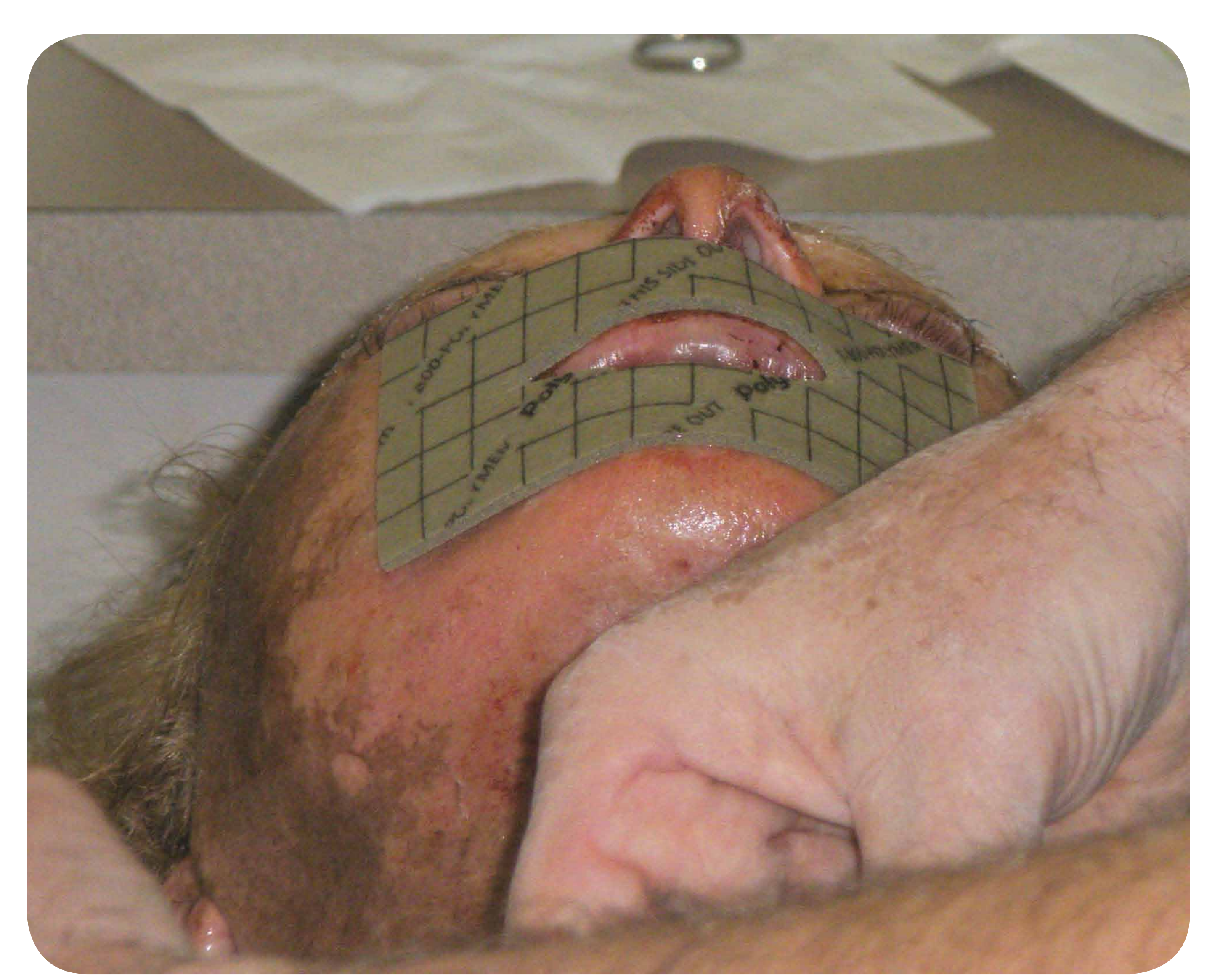
11 NOVEMBER: Silver polymeric membrane dressings cut and applied in order to reduce risk of infection.

The dressings optimized the final outcome in a shorter amount of time while enhancing patient comfort. Polymeric membrane dressings are now a standard part of this treatment.