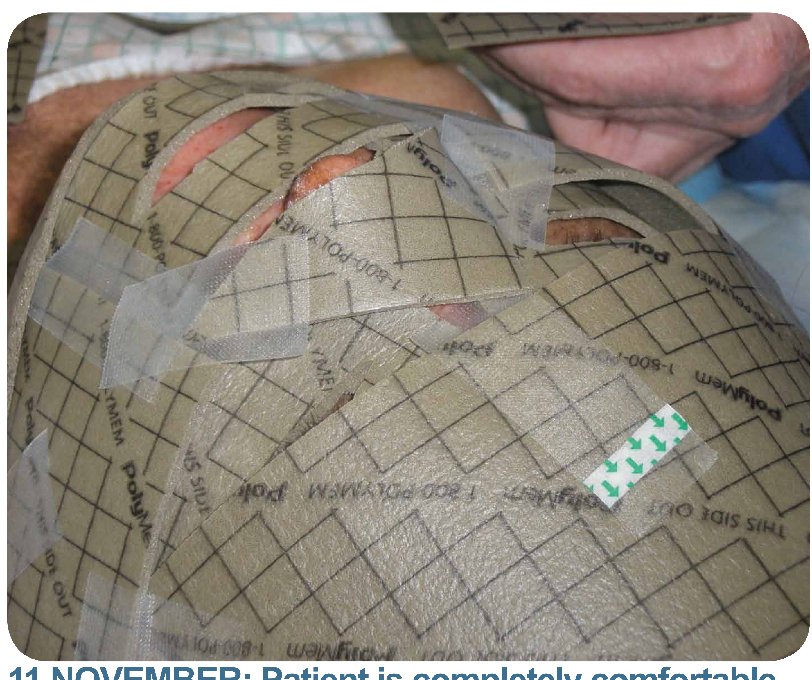
11 NOVEMBER: Patient is completely comfortable in a few hours after dressing application.