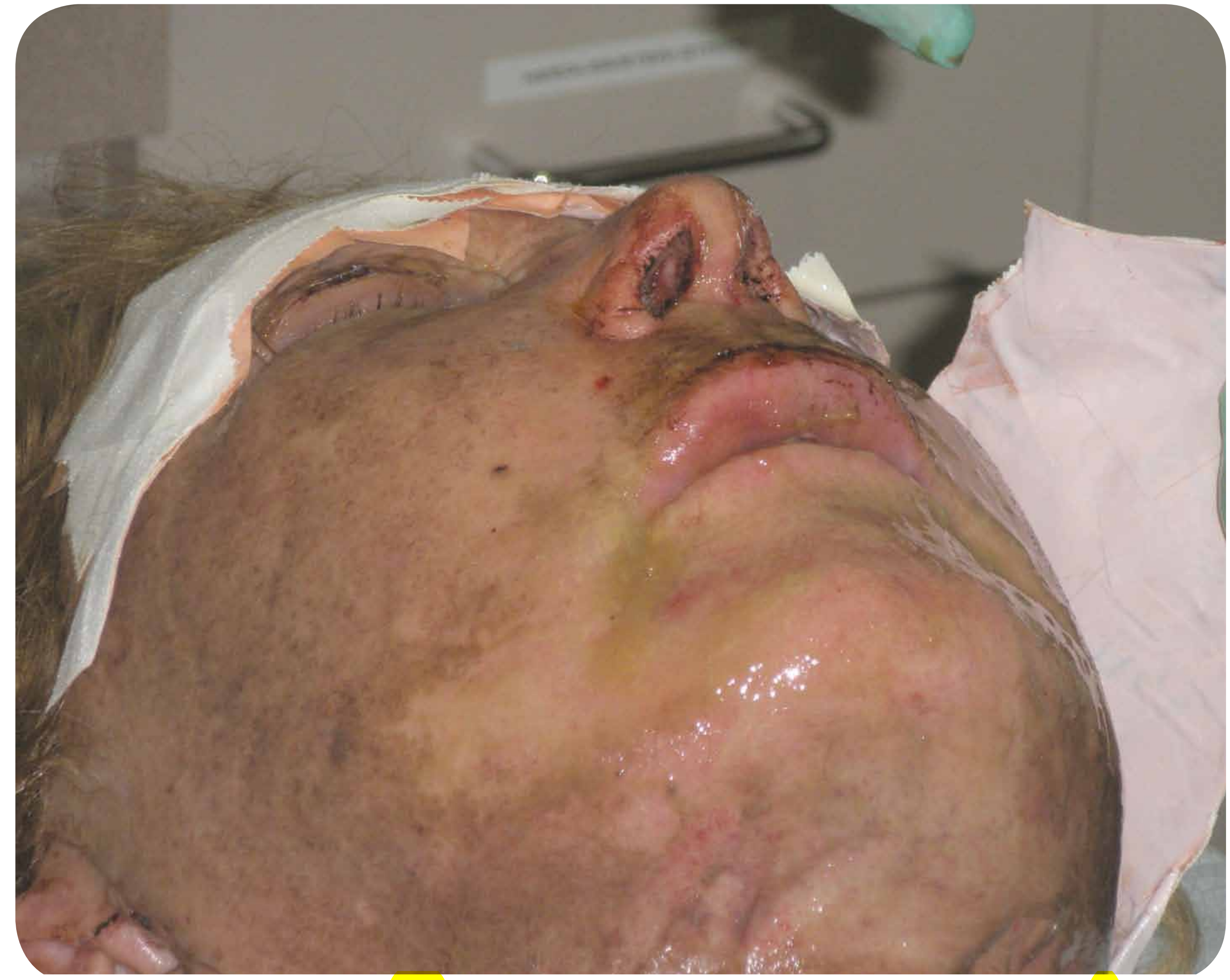
11 NOVEMBER: Occlusive plastic film removal.

*PolyMem<sup>®</sup> Silver<sup>®</sup> Dressings are made by Ferris Mfg. Corp., Burr Ridge, IL 60527 USA 800.POLYMEM (765.9636) • www.polymem.com