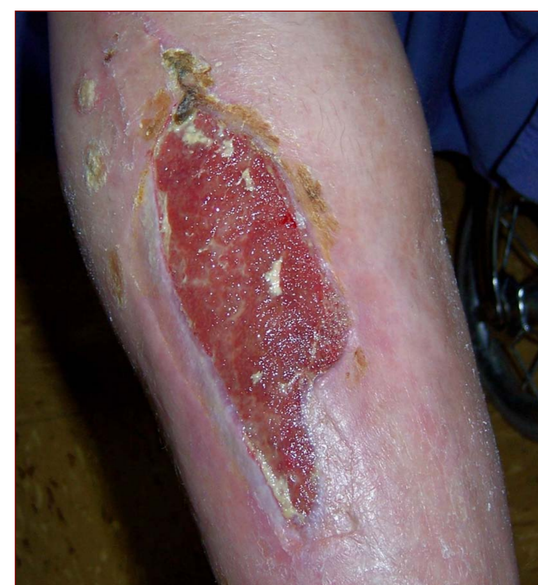
7 Feb 2006: 9.8 cm x 3.1 cm 95% granulation tissue. Still no pain at dressing changes or while dressing is in place.