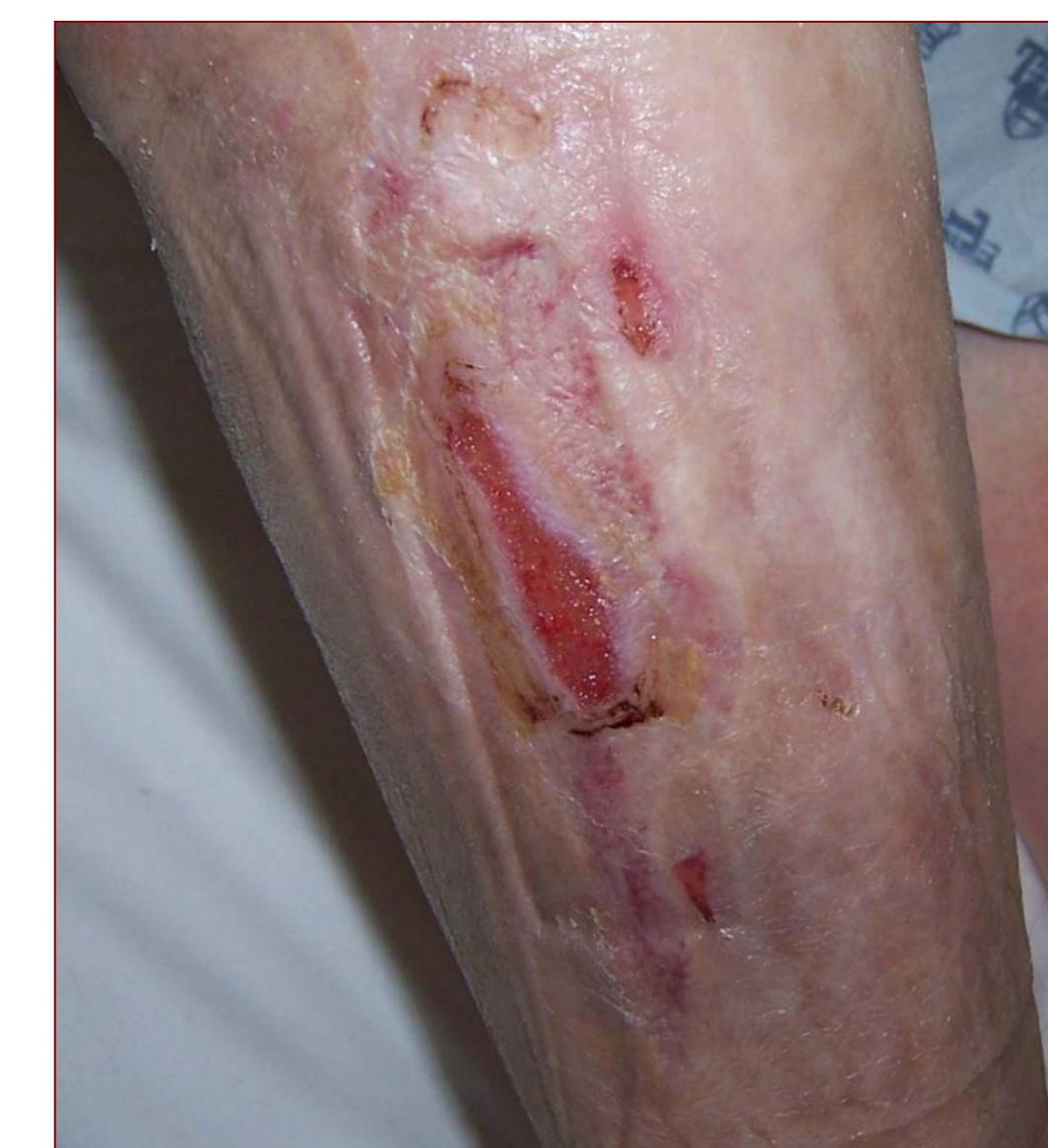
21 Mar 2006: 3 cm x 0.9 cm 100% granulation tissue. Dressings are now being changed every third day.