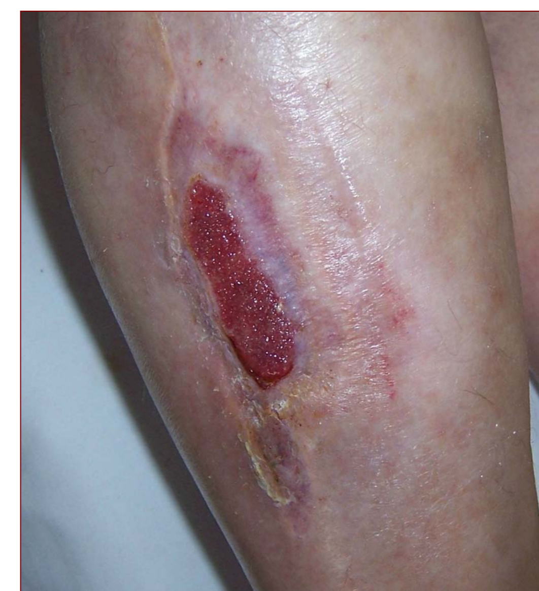
21 Feb 2006: 5.6 cm x 2.2 cm 100% granulation tissue. Dressings are now being changed every other day.