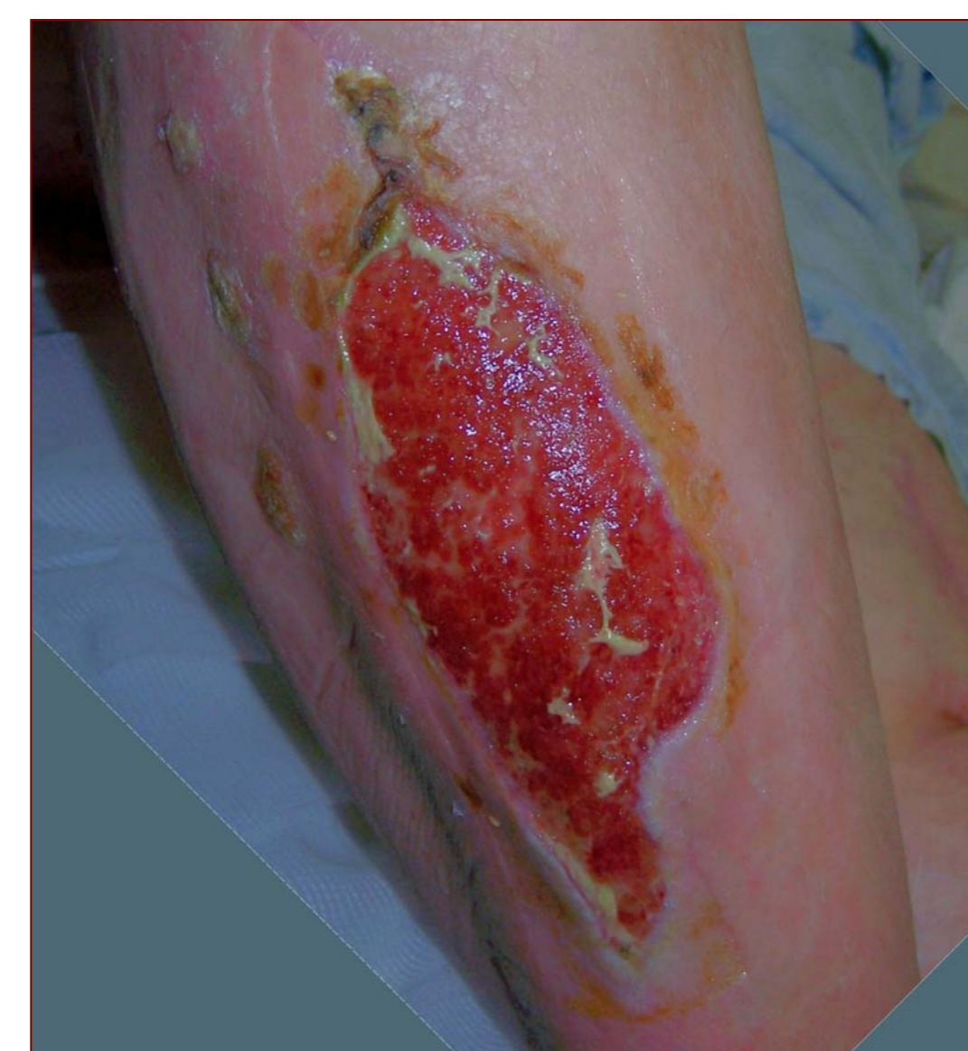
30 Jan 2006: 10 cm x 4.1 cm No wound cleansing needed for past week. Continuing polymeric membrane dressings.