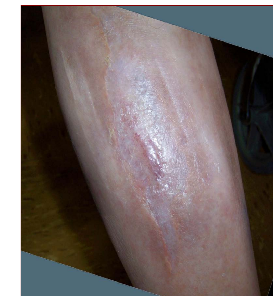
4 April 2006: Closed. No wound pain during the entire time of treatment (after day 1) with polymeric membrane dressings.